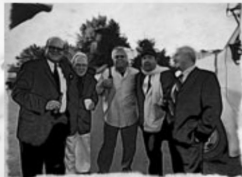
Backstage at the CBMA's!

cbma@nc.rr.com or Beach Music Air Force C/O Cammy Awards, Inc. P.O. Box 70 Pinebluff, NC 28373